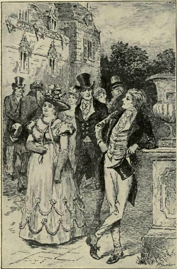
At once he turned to look at Athanase